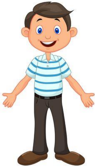
daddy – tata /dadi/