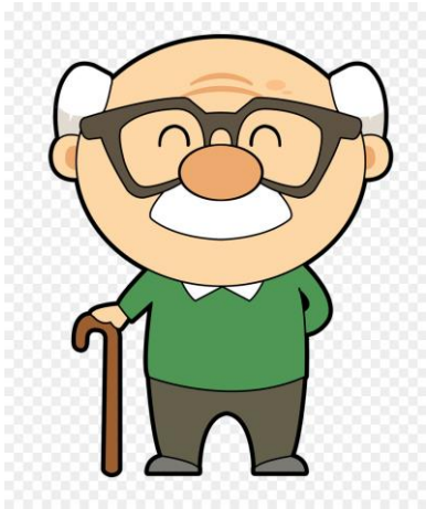
Grandpa – dziadek /grandpa/