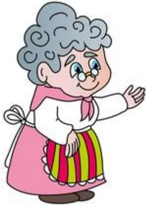
Grandma – babcia /grandma/